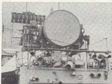
Left Starboard side deck detail: Seacat launcher, motor launch, liferafts and general detail of this part of the ship. Above The Seaslug guidance radar above the hangar. Note the various lights and aerials that can be seen. Both photos taken at Portsmouth Navy Day, August 23 1975.

The two 4.5-inch gun turrets have not altered, but two 20 mm Oerlikon general-