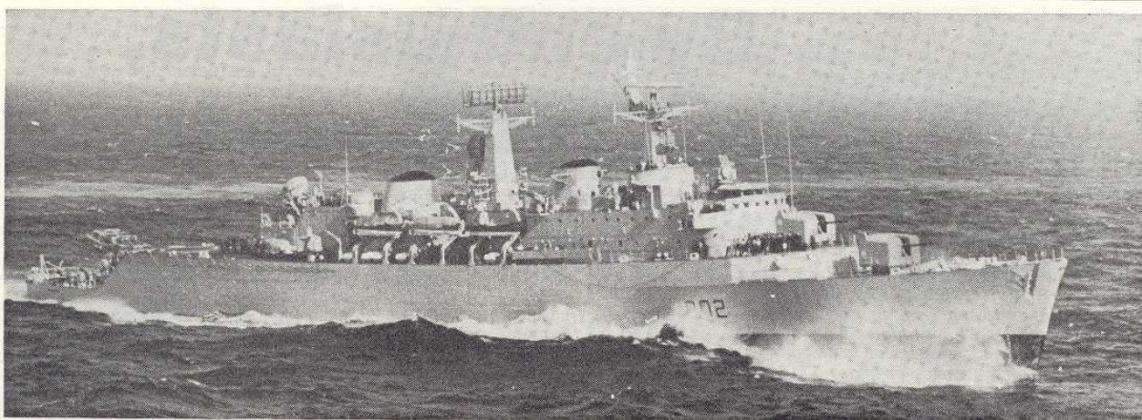
HMS Devonshire showing her paces, May 1973.