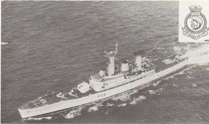
HMS Ajax was one of the first 'Leander' Class frigates to commission. Notice the contrast of the deck fittings and that all deck surfaces are green. At this time she had no Wasp helicopter and so shows no flight deck code aft.

Wolff's yard in June 1961, and as one might imagine, there are a number of variants within a class whose building programme extends over ten years. Examples of these appear in the appropriate table and all are easily adapted from the Airfix kit.