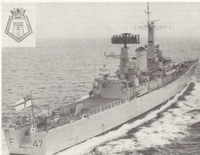
HMS Danae of the 'Leander' Class, with stern pennant number split on each side of the sonar 199 well. Note the draught marks at the point of the screws and, further forward at the cut-away in the keel.