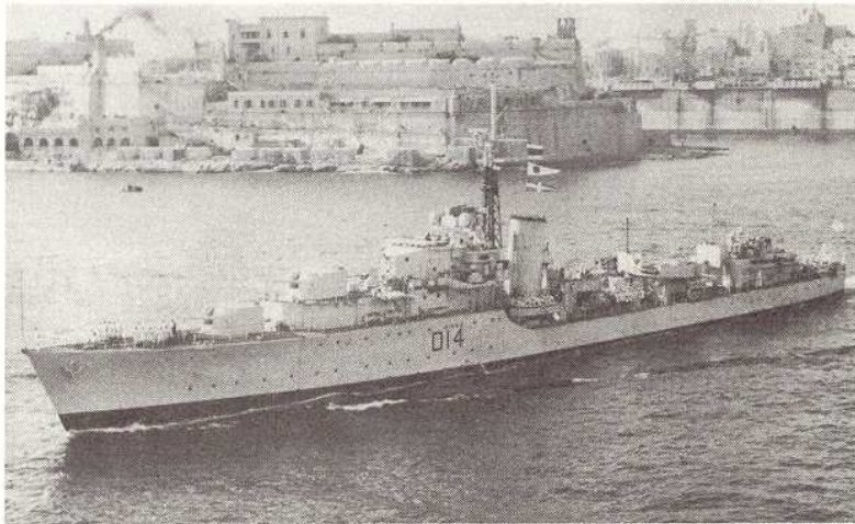
HMS Armada of the 'Battle' Class, in Grand Harbour, Valletta, Malta, flying her pennant number from the port yardarm.

ties. Further layout improvements were made, and the new weapon was fitted in the 'Battle' Class ships.