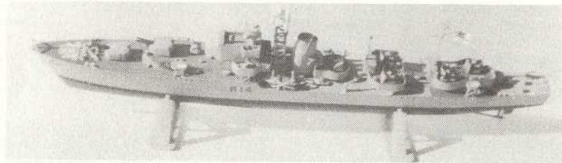
This is more a complete rebuild than a conversion, and represents a typical 'Battle' Class destroyer. Notice the scratch-built lattice mast, made from extended plastic sprue.

the bridge. A pair are, therefore, available in the Airfix Daring kit — of which more in due course.